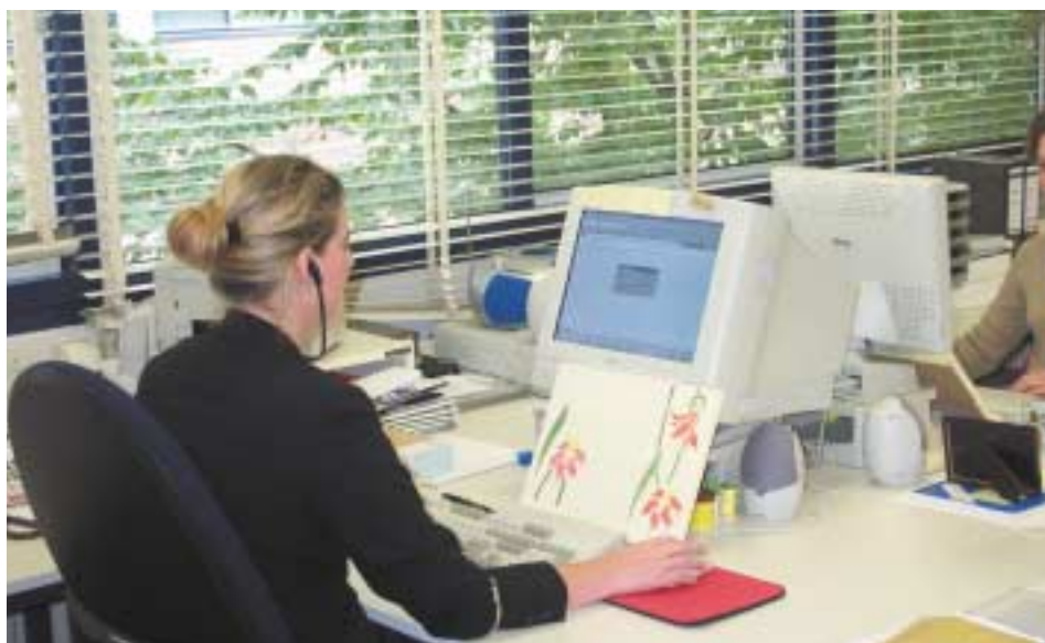
At the secretariat, the reports are processed further.

co-operation between the ICT department, Pathology and G2 Speech is the primary demand. Thanks to intensive co-operation, it was possible to implement the system quickly' according to Seldenrijk. 'G2 Speech regularly updates the software. Expansion or adaptation is always negotiable. If there are any problems, the helpdesk is easily accessible. Via a modem, one of the helpdesk staff can log in to the system and fix the